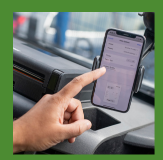
Seamless connections with Bluetooth, Wi-Fi, USB and communications with other devices.