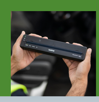
Compact and lightweight design for enhanced portability.