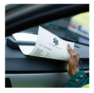
Durable, and dependable, PJ-800 series mobile printers has been designed to cater to many environments.