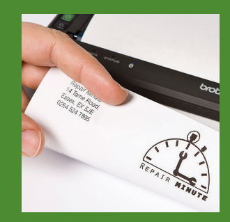
Direct thermal printing technology offers a reliable mobile printing solution.

A4 size document allows more detailed information to be reflected, such as invoices, service reports, delivery notes, etc. A full range of accessories is also available which can further enhance mobility.