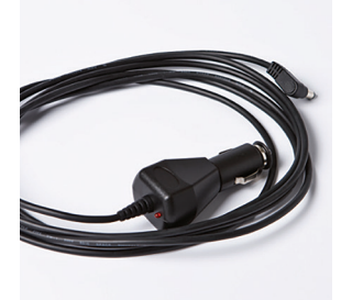
Choice of power options including Rechargeable Li-ion battery, AC Power adapters or vehicle Power kits.

Brother B-Pac Software Development Kit (SDK): https://support.brother.com/g/s/es/dev/en/mobilesdk/ download/index.html?c=eu_ot&lang=en&navi=offall&comple=on&redirect=on