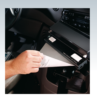
Use A4 cut sheet paper or continuous paper rolls. Simply tear the paper once printed.