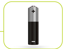
Use 6pcs of AAA Alkaline batteries