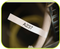
Cable labelling function