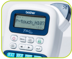
Easy-to-read display with print preview