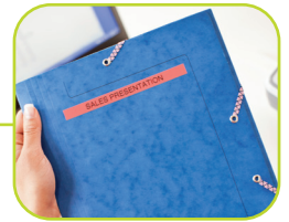
8 frames for label personalisation