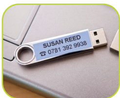
178 symbols attractive symbols