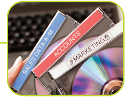
Deco mode designs