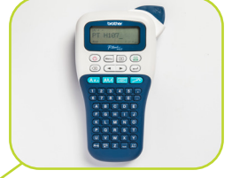
Compact and lightweight with ergonomic design