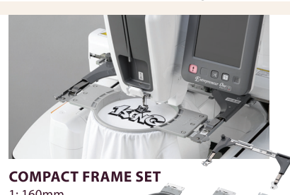
1:160mm 2 3 2:130mm 3: 100mm