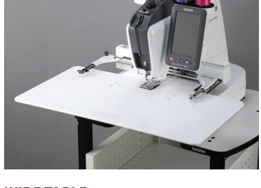
WIDE TABLE W762mmxD540mm