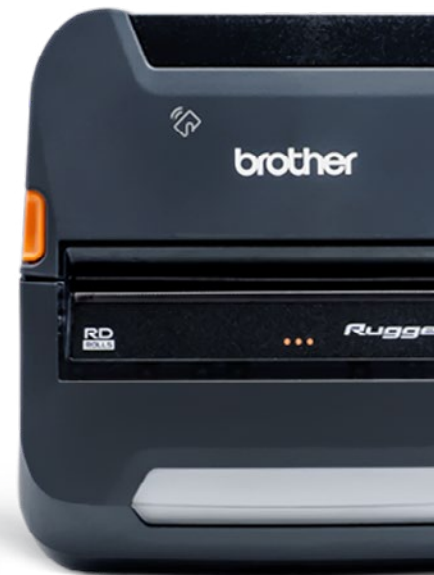
IntegraSys DSD Manager and Brother's RJ-4250WB