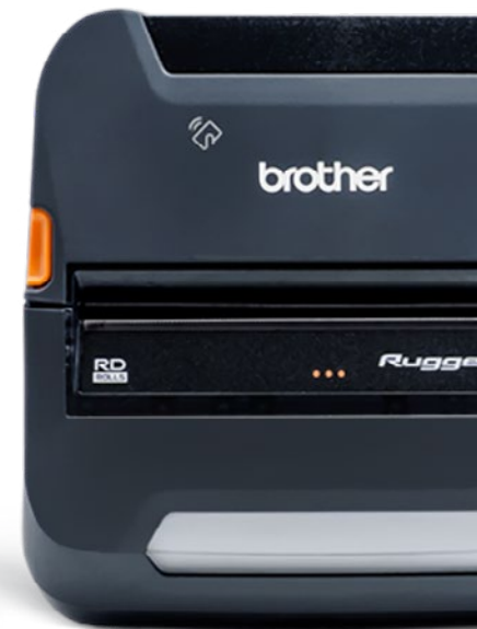
IntegraSys DSD Manager and Brother's RJ-4250WB